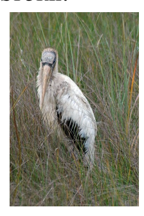
Males and females look the same, though males tend to be larger