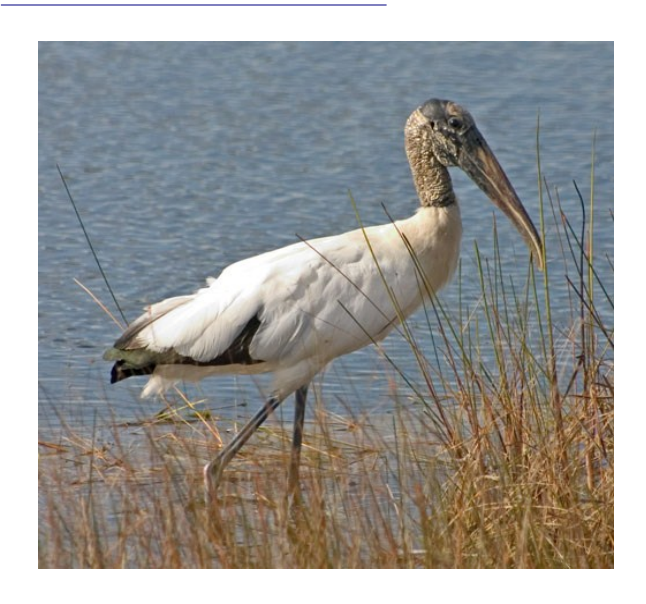
Protecting Tribal Resources