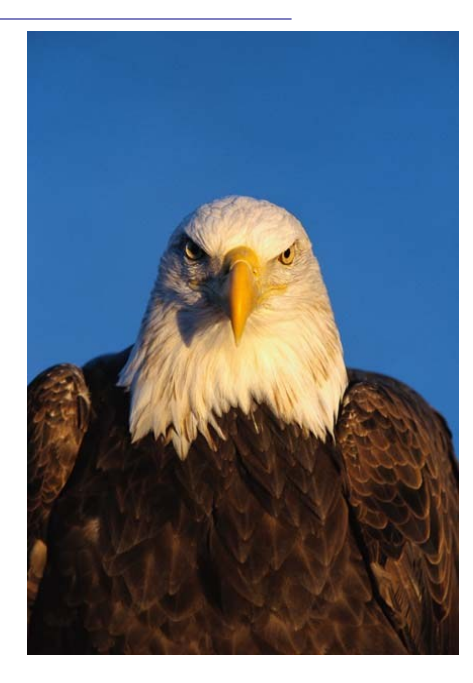
Protecting Tribal Resources